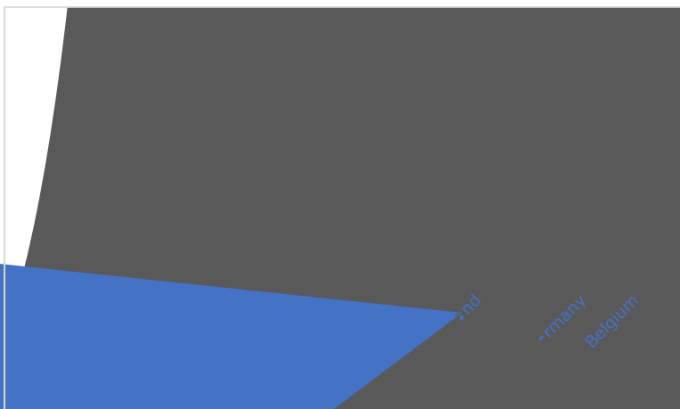
% Participation By Continent

The event had approximately 280 attendees. A total of 476 participants from 67 countries had registered for the event. Based on the registration data (which may differ somewhat from the actual attendee data), the geographic breakdown of attendees was as follows: 39% from Europe, 21% from North America, 17% from Asia and Africa, respectively, 4% from South America and 2% from rest of the world. The best-represented countries were the US and the UK.